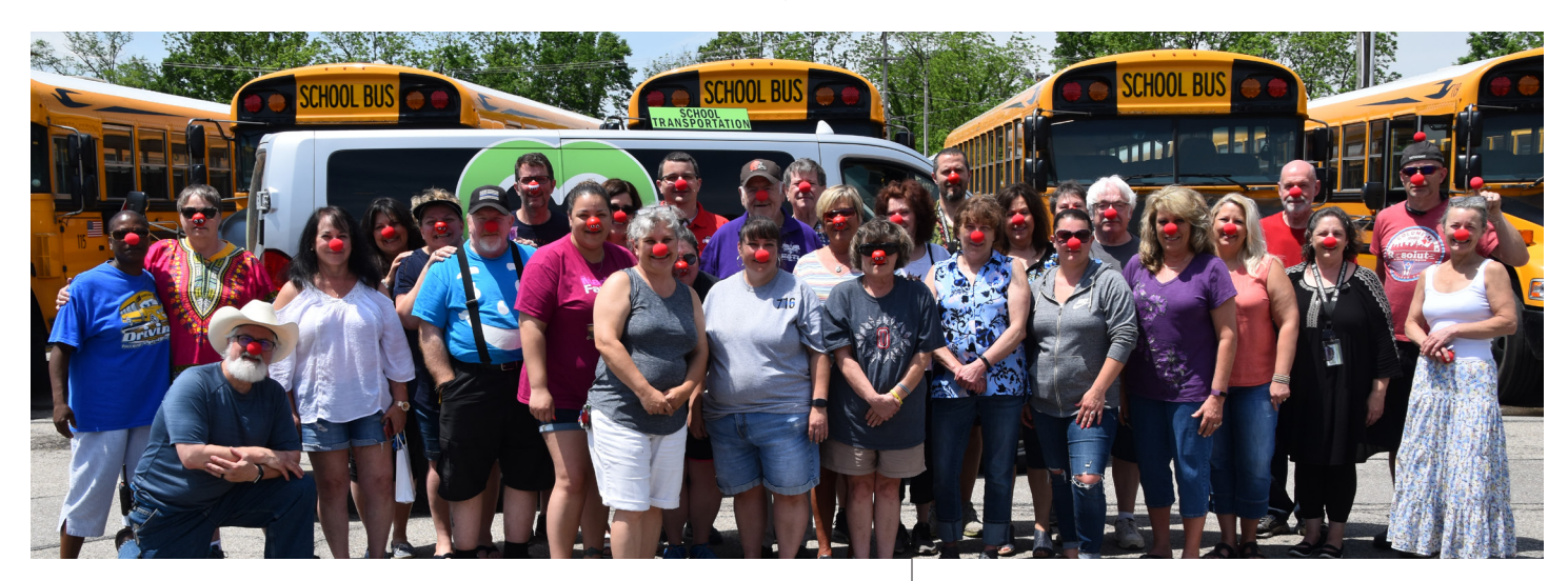
The Westerville City Schools Transportation Department joined the national Red Nose Day movement to raise money for children in need.