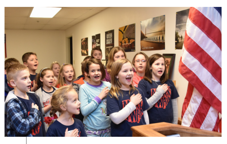
Students in the Mark Twain Elementary School Service Club lent a helping hand at the Marine Corps Family Support Community packing night.