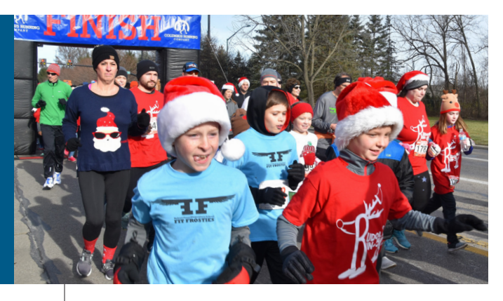
Westerville City Schools was well represented at the Rudolph 5K Run/Walk, hosted by the Westerville Lions Club and sponsored by Nationwide Children's Hospital.

December 7, 2018, announced that 57 Ohio schools received the Purple Star designation for their commitment to serving military-connected students and their families. Included in the latest round of honorees was Westerville Central High School. Westerville North earned the distinction previously.